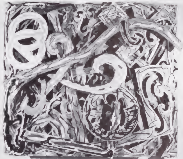
Frank Stella, Silverstone , 1981